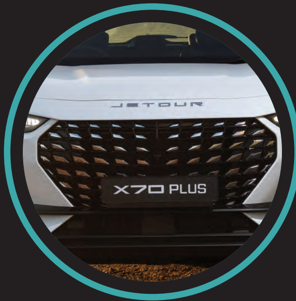
Octagonal front grille