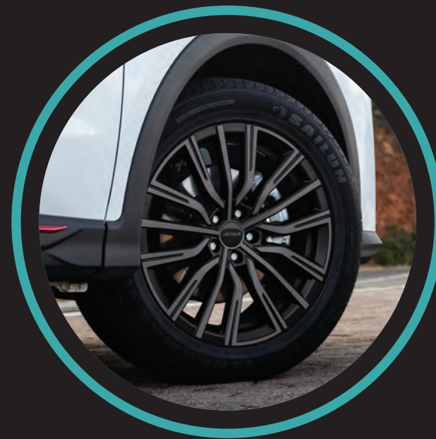
235/55R19 wheels with tyre pressure monitoring system