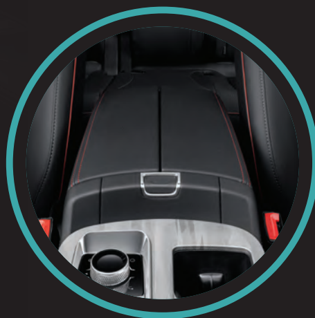
Armrest with cooling and heating functionality