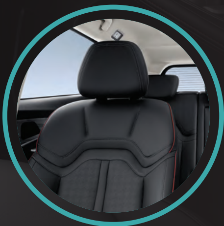
Black synthetic leather seats

The Jetour X70 Plus may sport a striking exterior, but its true essence lies within, where every detail exudes exclusivity and intuition. Inside, you'll discover an opulent cabin experience designed for spontaneous road trips and adventures. From the high-quality materials and advanced technology to the thoughtful design elements, every aspect of the interior is crafted to provide premium comfort.