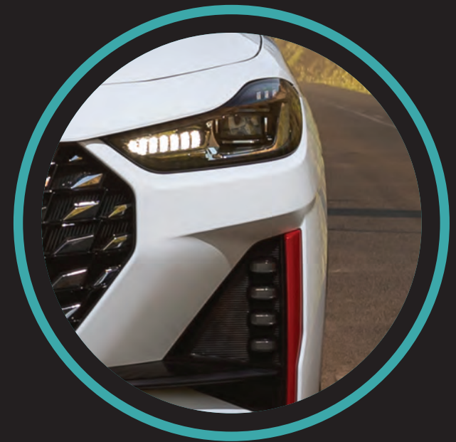
Automatic LED headlights + Daytime running lights