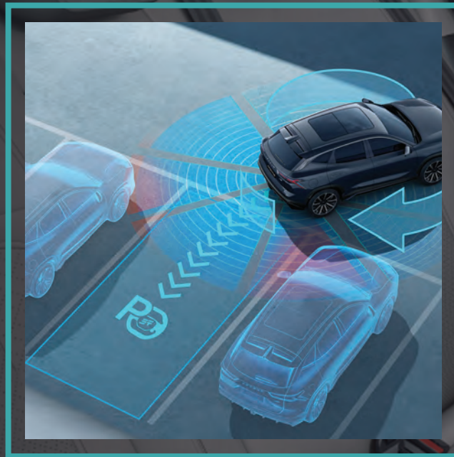
360° Panoramic Parking Assist