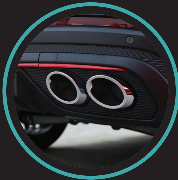
Quad tail pipes