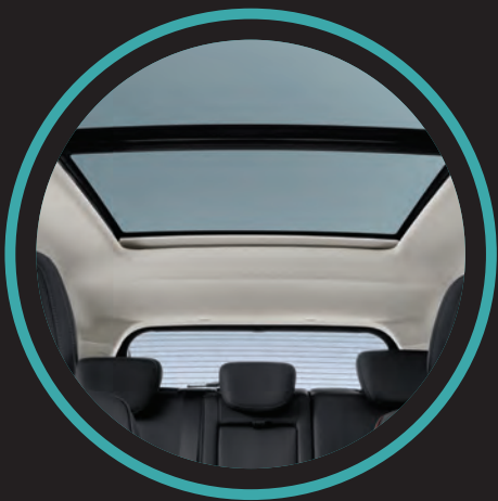
Panoramic glass sunroof

Sink into the plush leather bucket seats of the Jetour X70 Plus, where the panoramic glass sunroof bathes the cabin in warm sunlight, creating a serene and exclusive ambiance.