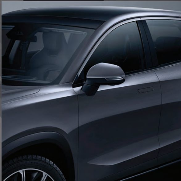
BSD (Blind Spot Detection)

With the Jetour X70 Plus, you'll experience a fusion of advanced and intuitive safety features that keep you secure from start to finish. Navigating the open road is as effortless as it is exhilarating with leading-edge safety features such as Rear Cross Traffic Alert (RCTA), 360° Panoramic Parking Assist, Rear parking camera and more.