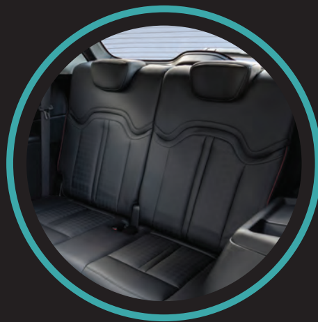
3rd row seats (7-seater)