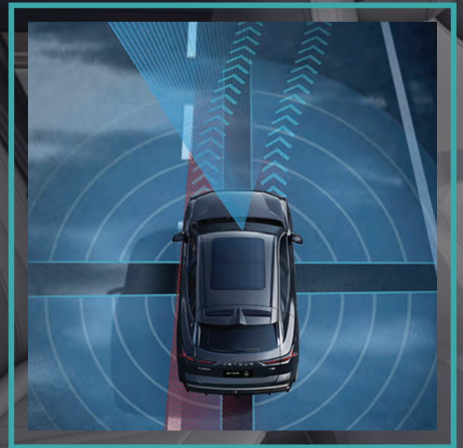
LCA (Lane Change Assist)