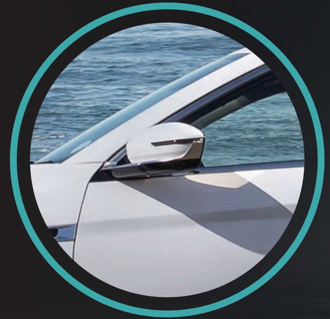
360° Panoramic view parking assist