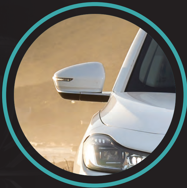
Exterior rearview mirror electrically adjustable and automatic folding

At first glance, a harmonious dance of curves and angles create a visual masterpiece that's both striking and efficient. Meticulous craftsmanship is on full display, highlighted by a commanding grille flanked by two elongated LED headlights, ensuring you're seen and safe.