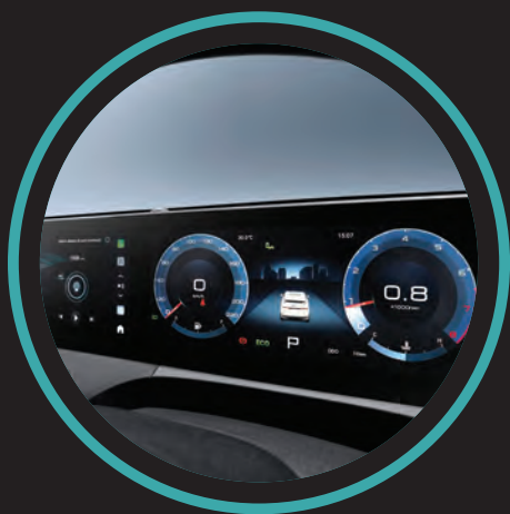
Dual 10.25" instrument cluster and infotainment system

The in-cabin experience embodies modern elegance and understated confidence, with ambient lighting casting a soothing glow and finely detailed red stitching highlighting every carefully considered design element.