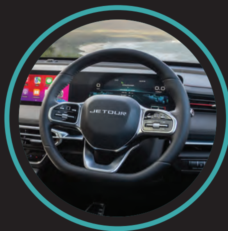
Intelligent voice command