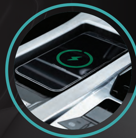
Wireless charging tray 50W