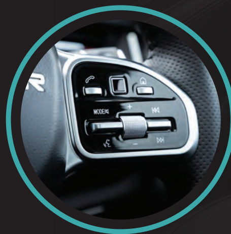
Multifunctional steering wheel