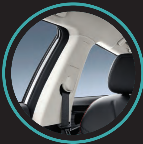
Front side airbags (driver and passenger)