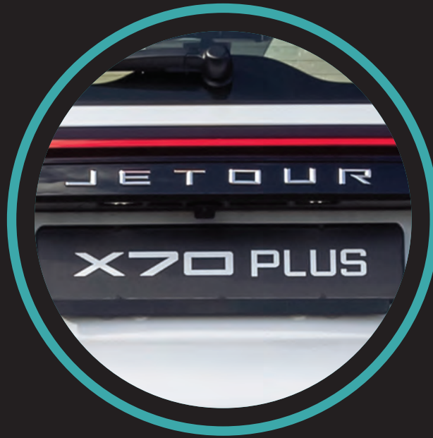
Rear parking camera with sensors